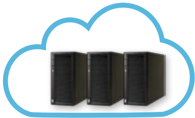
RISCO Cloud Server